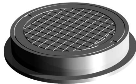
*To Be Used With Vertical Pipe See Table to Left