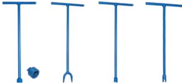
Pent End 2-Hole End Rod End Curb End