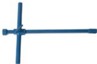
Curb End x Pent Slide Handle Wrench