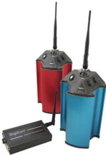
Digital Leak Locator