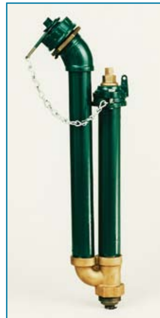
The MainGuard Model #78 Blow-Off Hydrant

The Model #78 has the same features as the Model #77 Blow-Off hydrant except that it is designed for underground installations. The Model #78 can be placed in a meter box pit for easy access.