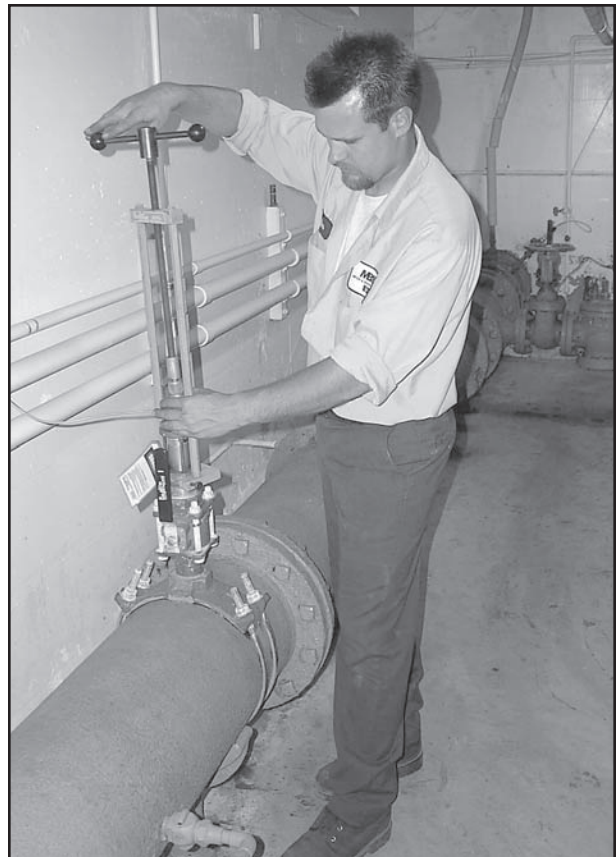
MBS technician installing a flow meter