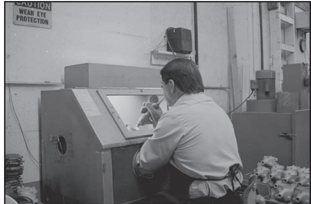
MBS personnel preparing for a meter installation project