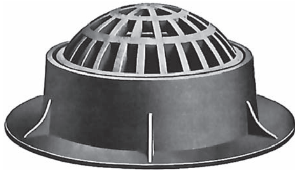
R-2560 Beehive Grate with Frame