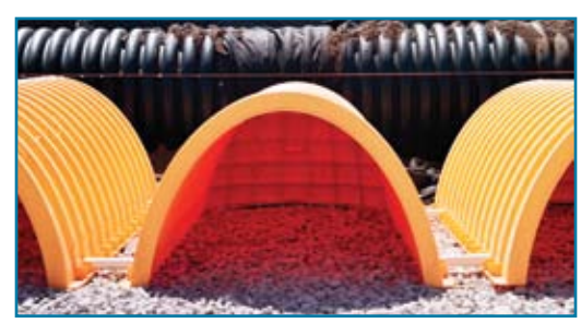
Chambers Must Be A Minimu of 6" Apart