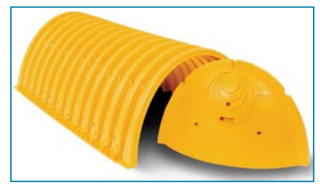
Chamber Shown With End Cap