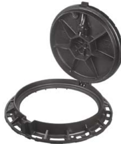
PAMREX In Open Position