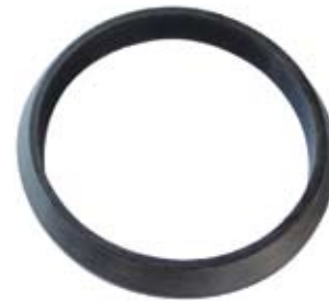
Standard Gasket SBR