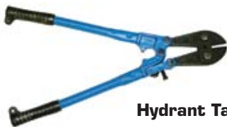
Hydrant Tag Crimping Tool