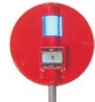
Shown mounted on 3/8" rod