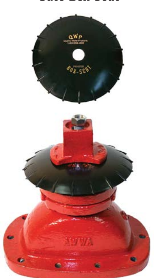
Valve shown with Gate Box Seat installed under operating nut

The Gate Box Seat is a high-strength, plastic device designed to eliminate the annoying and costly problem of having to re-dig a valve box base that has shifted off center during the backfilling process. The Gate Box Seat is easily installed by removing the valve's operating nut and sliding it over the valve stem. When in place it automatically centers the valve box base around the operating nut and prevents the backfill material from interfering with valve operation while still allowing surface water to drain out. Any surface debris that does enter the valve box can quickly and easily be flushed out using air or water.