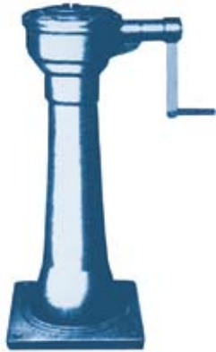
Extra Heavy Geared Pattern, Non-Rising Stem with Indicator

NOTE: Ball thrust bearings and motor operated floor stands can be furnished when specified.