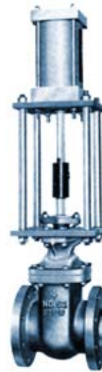
Gate Valve with Commercial Cylinder

Gate valves requiring speedy or frequent operation or valves that are not easily accessible may be equipped with hydraulic or pneumatic cylinders. Cylinder operated valves are generally installed on lines where pressures are 150 lbs. per square inch or less. Where required, higher pressure cylinder operated valves are available.