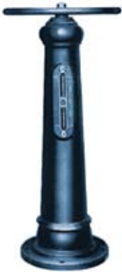
Non-Rising Stem with Indicator