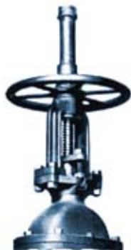
Semi-Enclosed Style (enclosed style not shown)

OS&Y valves installed in extremely dirty or corrosive atmosphere locations may be equipped with steel or clear plastic Stem Protectors to protect the stem threads.