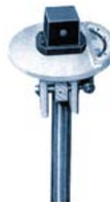
Ground Level Indicator

Gate valves requiring speedy or frequent operation or valves that are not easily accessible may be equipped with hydraulic or pneumatic cylinders. Cylinder operated valves are generally installed on lines where pressures are 150 lbs. per square inch or less. Where required, higher pressure cylinder operated valves are available.