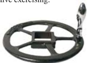
Handwheel Shown With Optional Speed Handle

The Handwheel is made of ductile iron for strength. The set screw with cup point assures that the handwheel stays locked onto the operating nut. The size of the raised lettering is 1/2". The 2" square nut protrudes 3/4" above the handwheel top surface which provides the option of using a standard gate wrench. An optional 3/4" speed handle is available for valve exercising.