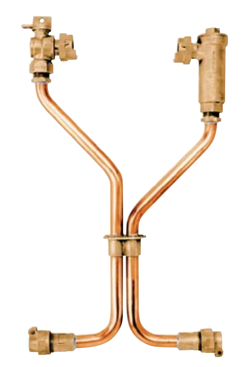
Series 90 Coppersetter shown with optional Bracing Eye

NOTE: 90 Series Coppersetter with Cartridge Dual Check Valve has a 15" minimum height for \frac{5}{4} ", \frac{5}{4} " × \frac{3}{4} " and \frac{3}{4} " meters and 18" minimum height for 1" meters.