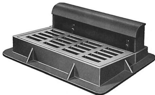
R-3246 Curb Inlet Frame, Grate, Curb Box