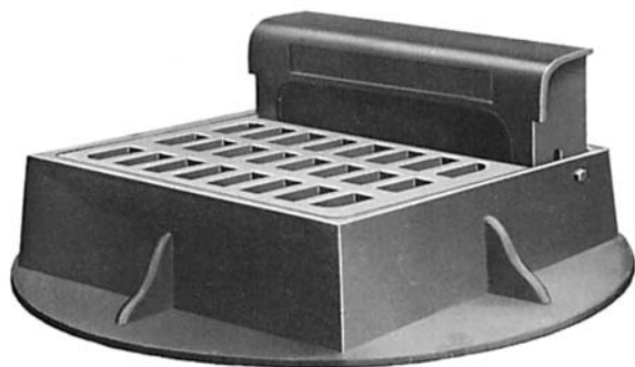
R-3010 Curb Inlet Frame, Grate, Curb Box