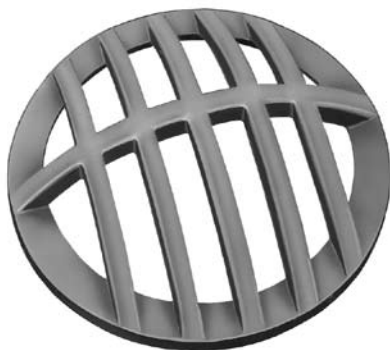
R-4351-D Beehive Grate