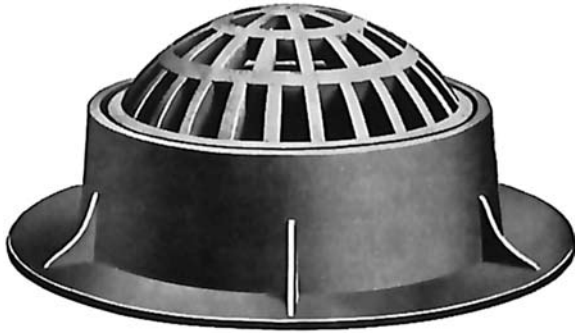
R-2560 Beehive Grate with Frame