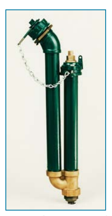
The MainGuard Model #78 Blow-Off Hydrant

The Model #78 has the same features as the Model #77 Blow-Off hydrant except that it is designed for underground installations. The Model #78 can be placed in a meter box pit for easy access.