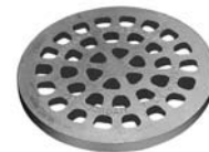
Type M Radial Flat Grate Approx. 140 Sq. In. of opening