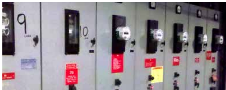
Some of the new FlexNet™ meters already installed.