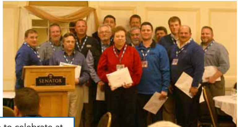
There was much to celebrate at this year's Managers' Meeting